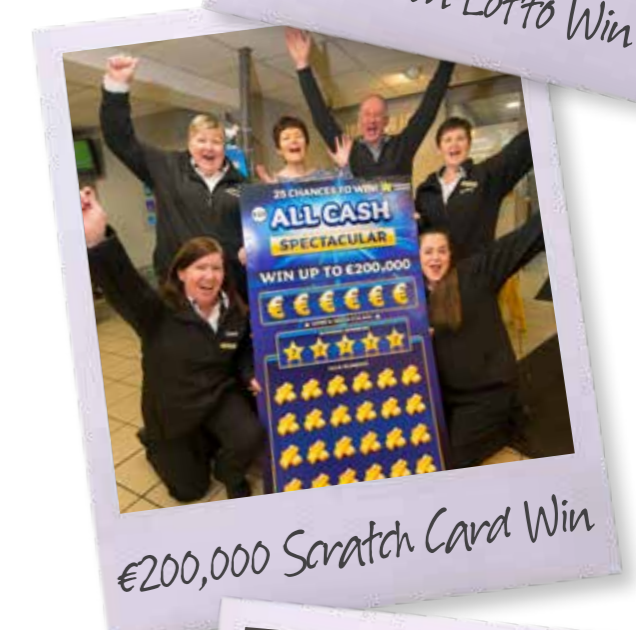
€200,000 Scratch Card Win