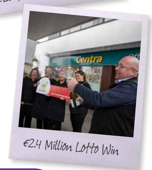
€2.4 Million Lotto Win