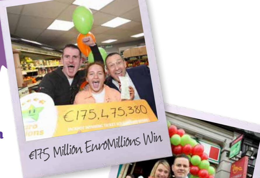
€175 Million EuroMillions Win