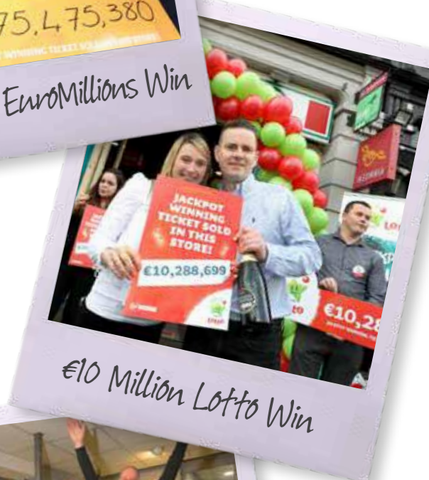
€10 Million Lotto Win