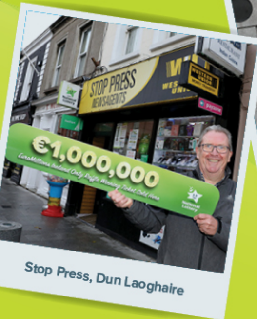
Stop Press, Dun Laoghaire