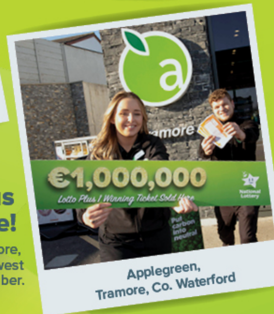
Applegreen, Tramore, Co. Waterford

Staff at Applegreen in Tramore, Co. Waterford welcome Ireland's newest Lotto Millionaire in November.