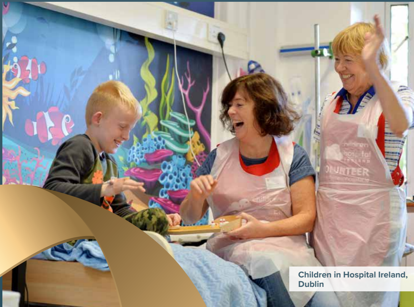
Children in Hospital Ireland, Dublin

The Awards honour the inspiring work and achievements of thousands of projects, clubs and individuals from all over Ireland who, with the help of National Lottery Good Causes funding, have had an extraordinary impact on their local communities. Nearly 30 cent in every €1 spent on National Lottery games goes back to Good Causes all over the country.