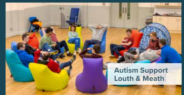
Autism Support Louth & Meath