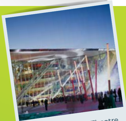
Bord Gais Energy Theatre