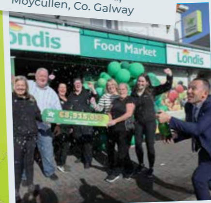
Londis, Duleek, Co. Meath