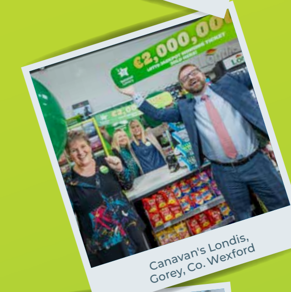
Canavan's Londis, Gorey, Co. Wexford