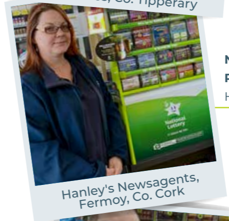
Hanley's Newsagents, Fermoy, Co. Cork

National Lottery Retailer of the Year Runner Up Spar Maxol, Irishtown