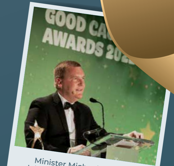
Minister Michael McGrath, delivering the keynote address