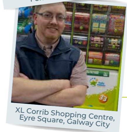
XL Corrib Shopping Centre, Eyre Square, Galway City

National Lottery Retailer of the Year Runner Up Maple Service Station, Falcarragh