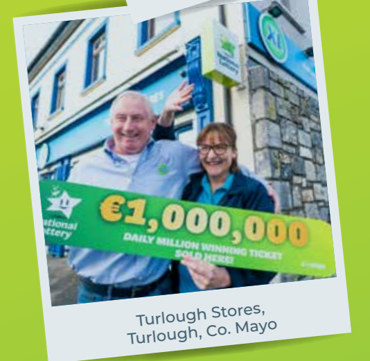
Turlough Stores, Turlough, Co. Mayo