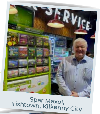
Spar Maxol, Irishtown, Kilkenny City

National Lottery Retailer of the Year WINNER Harvey's Spar, Thurles