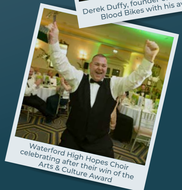
Waterford High Hopes Choir celebrating after their win of the Arts & Culture Award