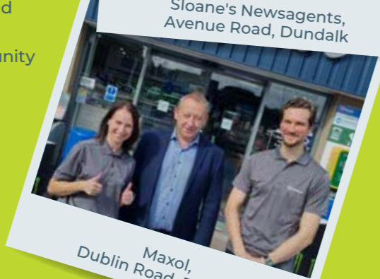
Maxol, Dublin Road, Dundalk