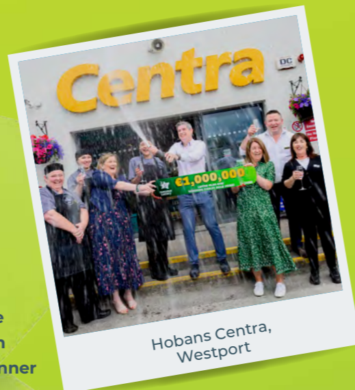
Hobans Centra, Westport

“This is by far the biggest win that we have ever had so we’re all thrilled here in the store. We have a team of around 20 working here and we’re all just over the moon as it’s not everyday that you hear that one of your customer’s has become an overnight millionaire. The shop is located in the heart of the town here in Westport and all year round we’re kept busy with local and holiday trade. As a family run store, we’re all delighted for the winner and wish them all the very best with their huge win.”