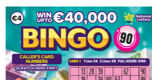
303 Bingo 90