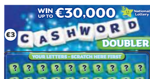
304 Cashword Doubler