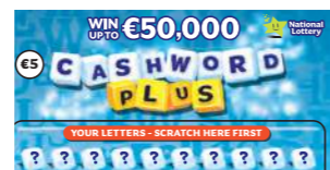
305 Cashword Plus