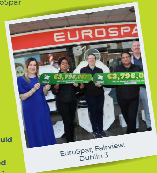
EuroSpar, Fairview, Dublin 3

"It's been a big weekend all round! The win is hugely life-changing for the winner themselves but this is also the biggest prize that we have ever sold so it's a very exciting time for the store. We have lots of locals who come into us regularly so it would be great to think that someone in the area may have had a life-changing win but of course, it could be anyone! We are delighted for the winner and hope they're already enjoying the buzz of their great news. We have a team of over 30 people working here in store and we're all just over the moon. Wins like this don't happen every day so we are all enjoying the celebrations and I imagine the excitement will last quite some time!"