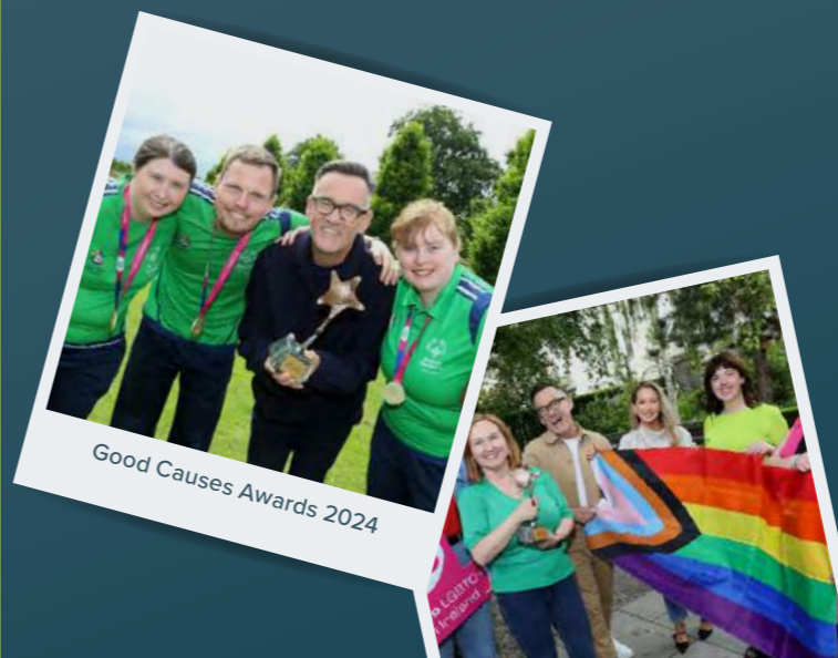
Good Causes Awards 2024