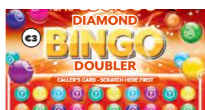
302 Diamond Bingo Doubler

Remove these games from sale on date indicated: