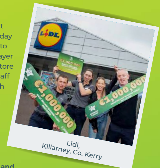
Lidl, Killarney, Co. Kerry

"I tell ya, I was suffering from the Monday blues and then I got the call with the great news that we'd sold a winning ticket worth a million euro and I just couldn't believe it! It made my day. I've been working in shops since the age of sixteen and this is the biggest win I've ever seen one of the customers get! We're a very busy store here and at this time of year our customer base is very mixed with tourists and locals. It's a life-changing amount for sure and I hope it brings joy and happiness to the winner."