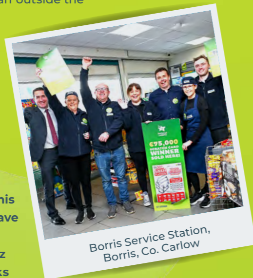
Borris Service Station, Borris, Co. Carlow

"This amazing story really is the talk of the town at the moment. I have only taken over the store very recently so this win is a great introduction to the local community! There have been lots of celebrations in the town over the last few days and we have all spoken to the winner so there's a great buzz around the place. We have lots of exciting plans in the works to develop the store very soon so it really is an exciting time for Borris at the moment."