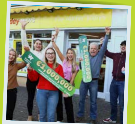
Day-Today, Ongar, Dublin 15

"In 2013, we sold a €4 million winning ticket, and now we've added another millionaire to the list. It's a great Christmas present for one of our customers!"