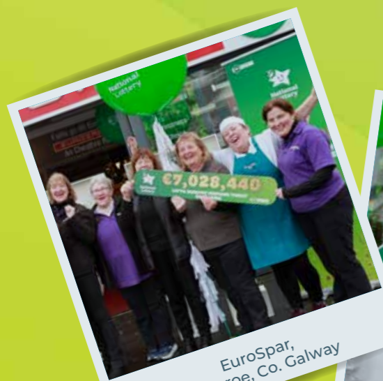
EuroSpar, Carraroe, Co. Galway

Could your store be next to create a millionaire? Keep an eye on your ticket scanners – the next big win could be just around the corner!