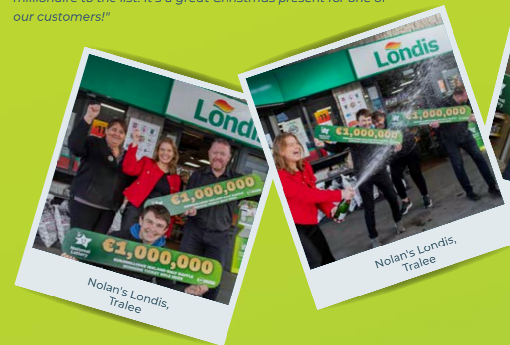
Nolan's Londis, Tralee