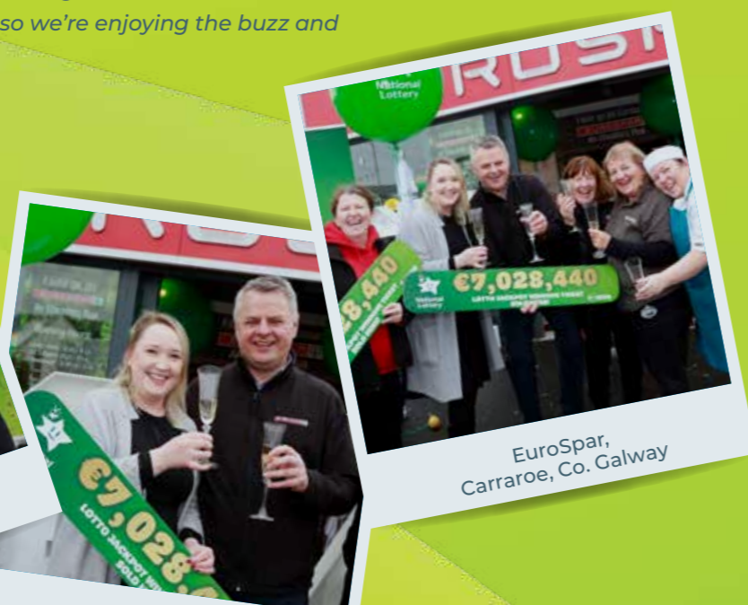
EuroSpar, Carraroe, Co. Galway