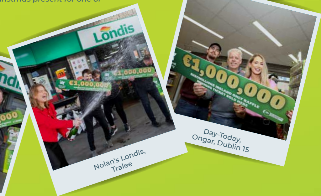
Day-Today, Ongar, Dublin 15