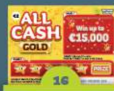
Game 601 All Cash Gold