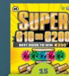
Game 804 Super €10 or €200