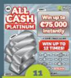
Game 626 All Cash Platinum