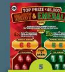
Game 800 Ruby & Emerald