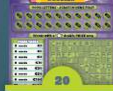
Game 625 Cashword Doubler