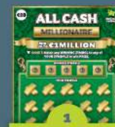
Game 620 All Cash Millionaire