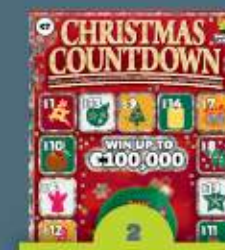
Game 629 Christmas Countdown