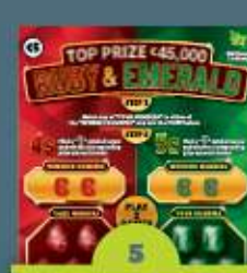
Game 800 Ruby & Emerald