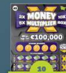
Game 802 Money Multiplier