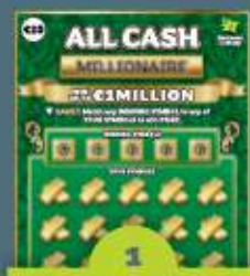
Game 620 All Cash Millionaire