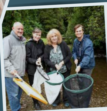
Nature Network Ireland, Heritage Finalist