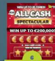
Game 603 All Cash Spectacular