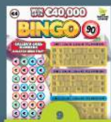
Game 623 Bingo 90