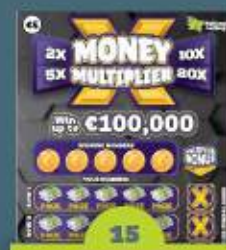
Game 802 Money Multiplier