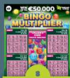
Game 615 Bingo Multiplier