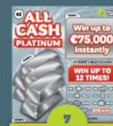
Game 626 All Cash Platinum