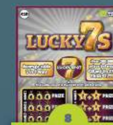
Game 801 Lucky 7's