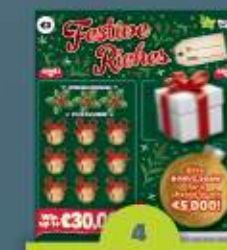
Game 627 Festive Riches