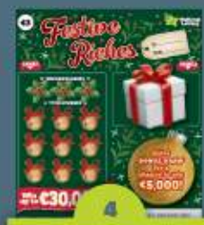
Game 627 Festive Riches