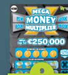
Game 608 Mega Money Multiplier