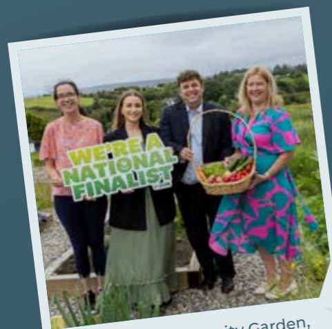
Kinaffe Community Garden, Health & Wellbeing Finalist

The full list of National Finalists can be found below and at www.lottery.ie/good-causes