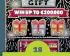
Game 604 All Cash Gift