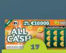
Game 600 All Cash