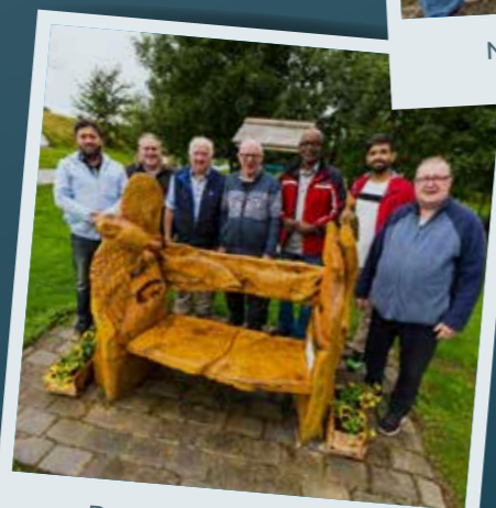
Borrisokane Men's Shed, Community Finalist