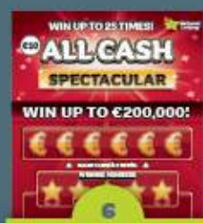
Game 603 All Cash Spectacular