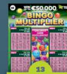
Game 615 Bingo Multiplier