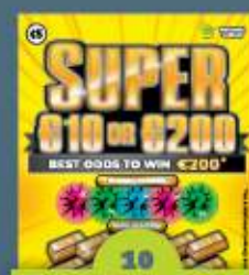
Game 804 Super €10 or €200