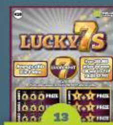
Game 801 Lucky 7's