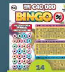
Game 623 Bingo 90