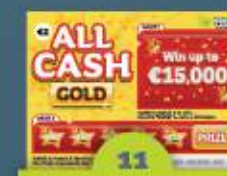
Game 601 All Cash Gold