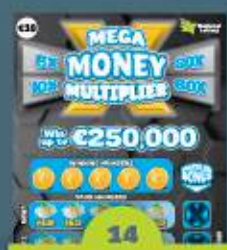
Game 608 Mega Money Multiplier