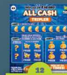
Game 602 All Cash Tripler