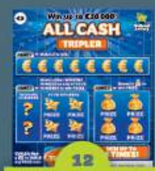
Game 602 All Cash Tripler