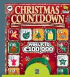
Game 629 Christmas Countdown