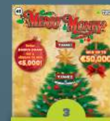
Game 628 Merry Money