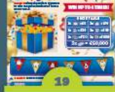
Game 618 Congratulations