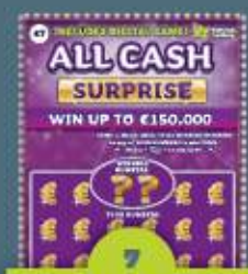
Game 287 All Cash Surprise