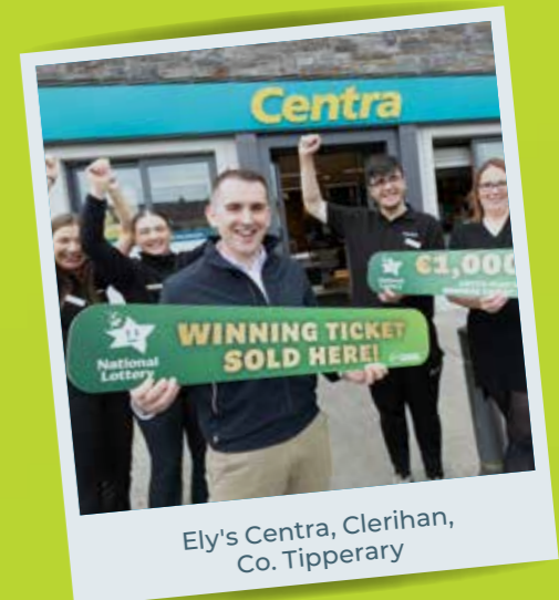
Ely's Centra, Clerihan, Co. Tipperary