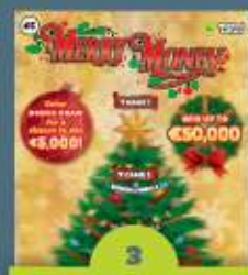
Game 628 Merry Money